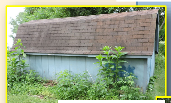
8 Ft. X 17 Ft. Shed