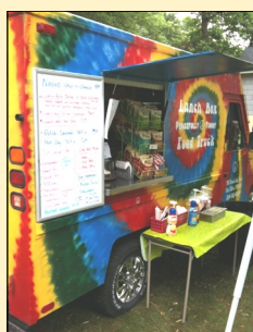
Lunch Box by "Celena"